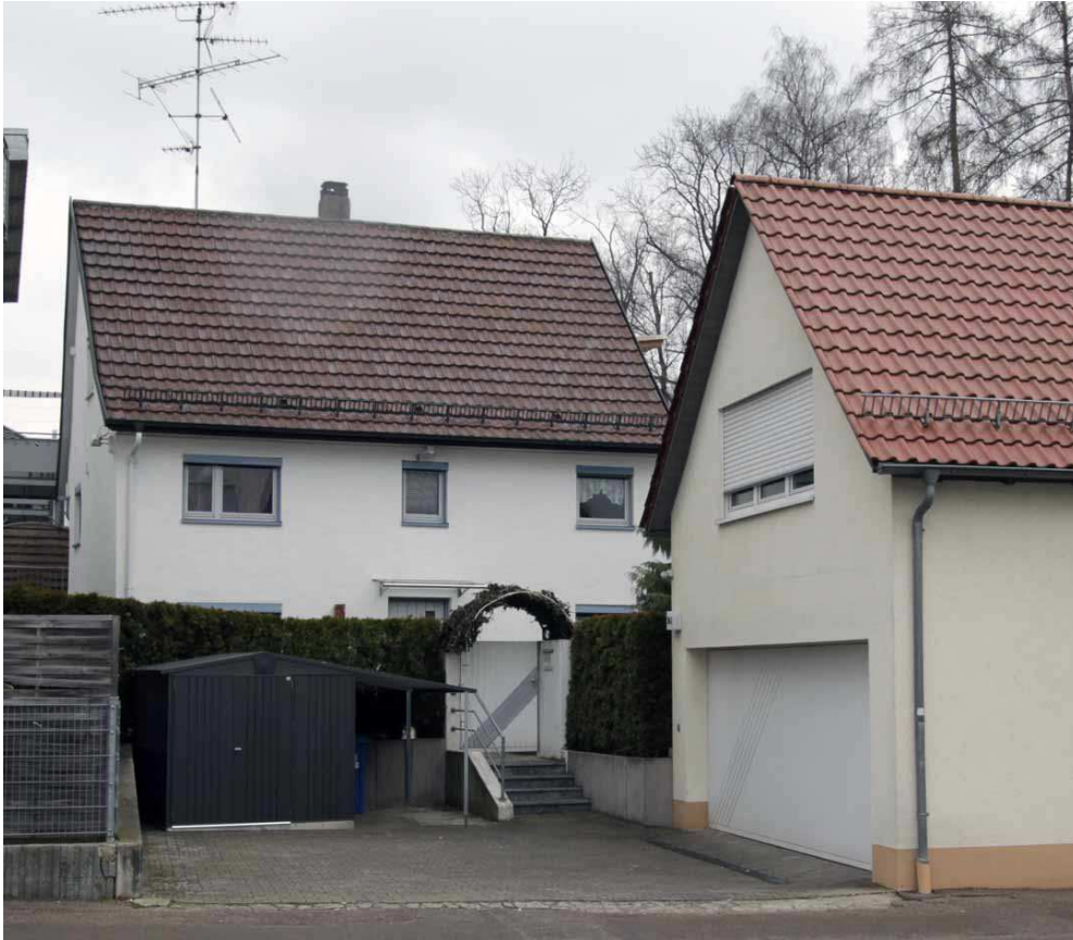
The house at Kapellenstr. 36/2, a bit away from the street, situated in the back of the courtyard.